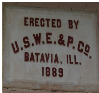
(Answer on Back Page)